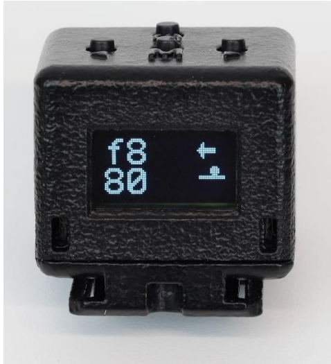
Line and Dot display