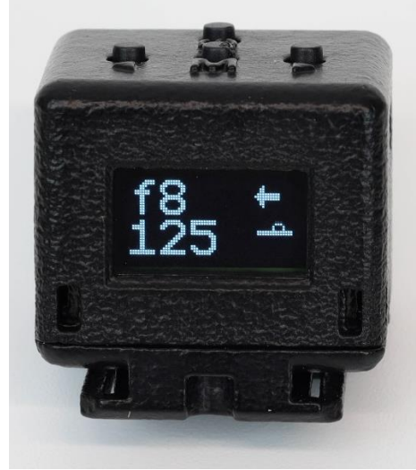
In continuous mode – dot is unfilled